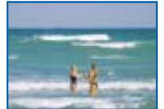
3 Råbylille Strand