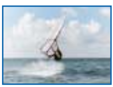
Paradise of Windsurfers