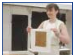
Paper workshop at the Museumsgården.