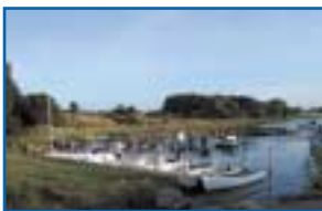
6 Bathing jetty at Skåninge Bro