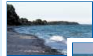
4 Hvide Klint