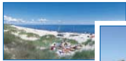
1 Ulvshale Beach