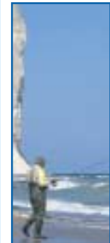
Coast fishing at Møns Klint