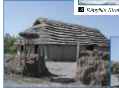
Seaweed dike at the Stoneage project in Stege.