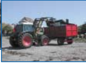
LIFE project on Møn - environment-friendly beach cleaning.