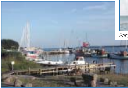
5 Hårbølle Port.